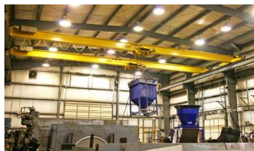
Industrial - Crane Building