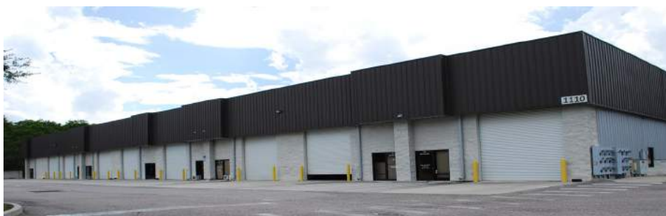
Commercial - Office/Warehouse