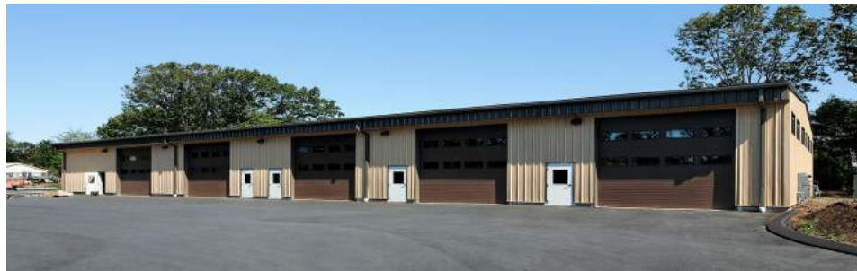
Small Business - Garages