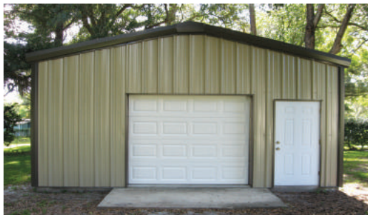
Residential - Workshop